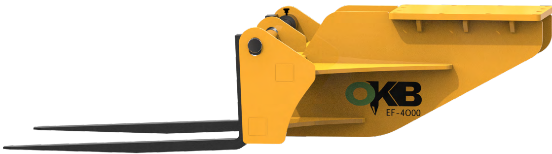
PALLET FORK SPECIFICATIONS